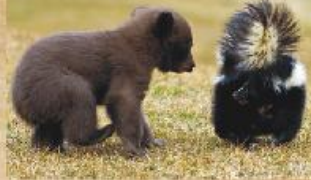
Too Playful With Others

Black bears can have fur color ranging from blond, cinnamon, or light brown to dark chocolate brown or jet black. Females can range in weight from 90 to 275 pounds. Males can weigh 125 to 550 pounds. They are incredibly powerful, able to easily flip over a 300 pound flat rock to get at food underneath. They are also excellent climbers. To protect their young, females will chase their cubs up a tree and then follow behind. Young bears will often climb trees to escape pursuit, and are commonly "treed" in local neighborhoods. Left alone, they will climb down and wander off. Bear cubs will stay with their mothers for 16 to 18 months. If a mother is killed with cubs less than a year old, the cubs will likely die unless they are brought to a sanctuary.