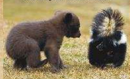
Too Playful With Others

Black bears can have fur color ranging from blond, cinnamon, or light brown to dark chocolate brown or jet black. Females can range in weight from 90 to 275 pounds. Males can weigh 125 to 550 pounds. They are incredibly powerful, able to easily flip over a 300 pound flat rock to get at food underneath. They are also excellent climbers. To protect the ir young, females will chase their cubs up a tree and then follow behind. Young bears will often climb trees to escape pursuit, and are commonly "tree'd" in local neighborhoods. Left alone, they will climb down and wander off. Bear cubs will stay with their mothers for 16 to 18 months. If a mother is killed with cubs less than a year old, the cubs will likely die unless they are brought to a sanctuary.